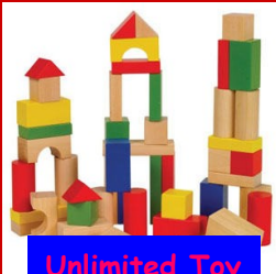
Unlimited Toy Library use