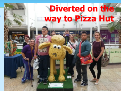
Diverted on the way to Pizza Hut