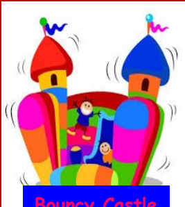
Bouncy Castle Hire