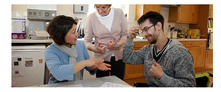
Here is an example of how makaton is used

Makaton is designed to help hearing people with learning and communication difficulties, it is an aid to communication not a language as such. British Sign Language "BSL" is a language with its own grammar and is used fluently by deaf people.